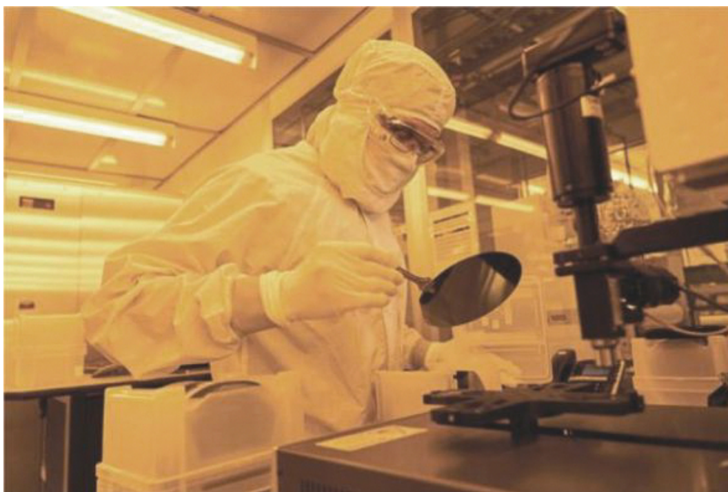
A Rigetti employee inspects a silicon wafer with superconducting quantum integrated circuits that was fabricated at Rigetti's Fab-1 facility.

Rigetti Foundry Services leverages the company's US-based in-house fabrication facility to deliver superconducting quantum chips to advance and accelerate quantum information science and technology research and development efforts. Customers include researchers spanning academia, defense laboratories, and national laboratories.