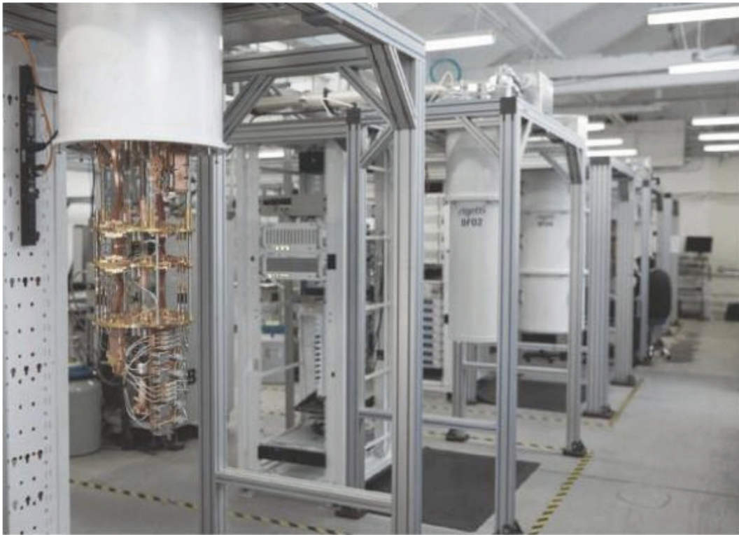
Rigetti's quantum computing facility in Berkeley, California includes both research and development and production quantum processing units, which are each housed in a cryogenic refrigerator.