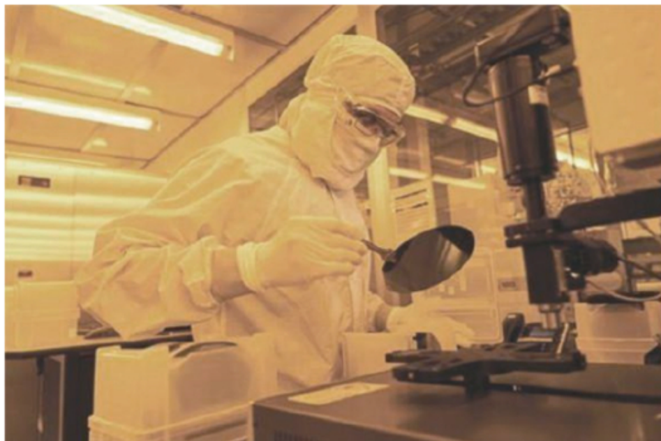
A Rigetti employee inspects a silicon wafer with superconducting quantum integrated circuits that was fabricated at Rigetti's Fab-1 facility.

Rigetti Foundry Services leverages the company's US-based in-house fabrication facility to deliver superconducting quantum chips to advance and accelerate quantum information science and technology research and development efforts. Customers include researchers spanning academia, defense laboratories, and national laboratories.